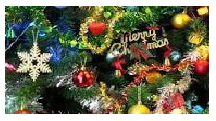
The New Year is coming soon — be prepared!