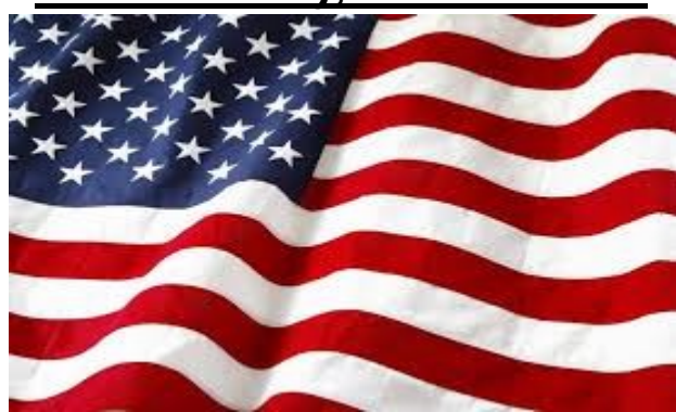
Celebrating all branches of the US Military

Please say a Prayer for all of them TODAY!